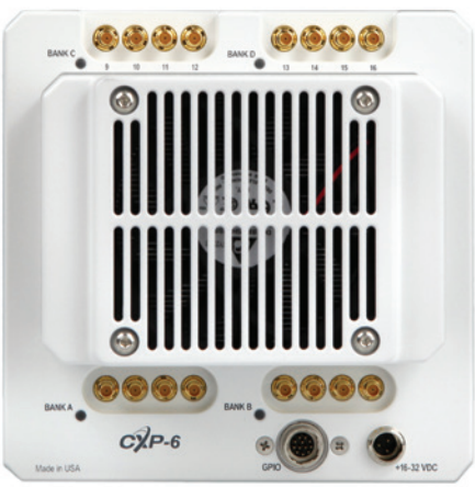
Phantom S990 - Back Panel