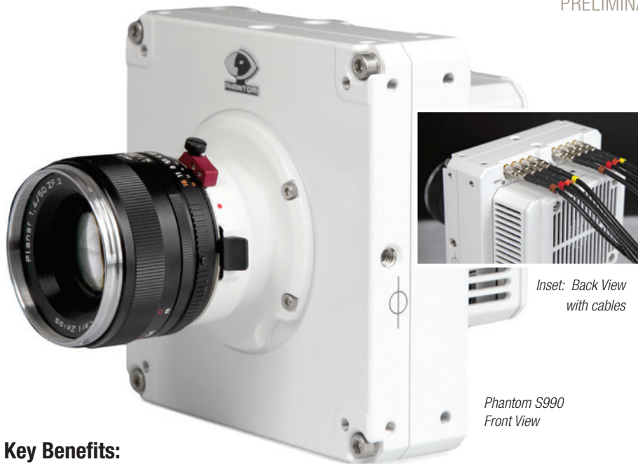
Inset: Back View with cables

For the most current version visit www.phantomhighspeed.com Subject to change Rev April 2018