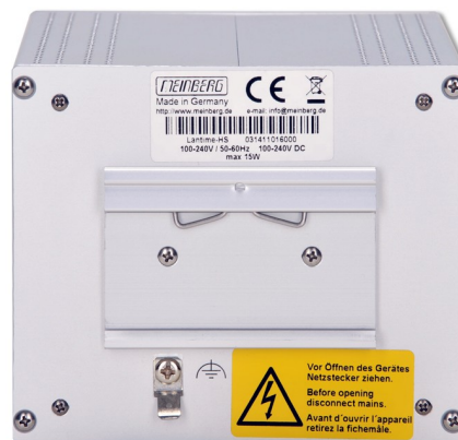
Rear view: LANTIME M100