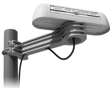
DCF77 Antenna AW02 with mounting kit

1 x Meinberg DCF77 antenna input, BNC female connector, isolated