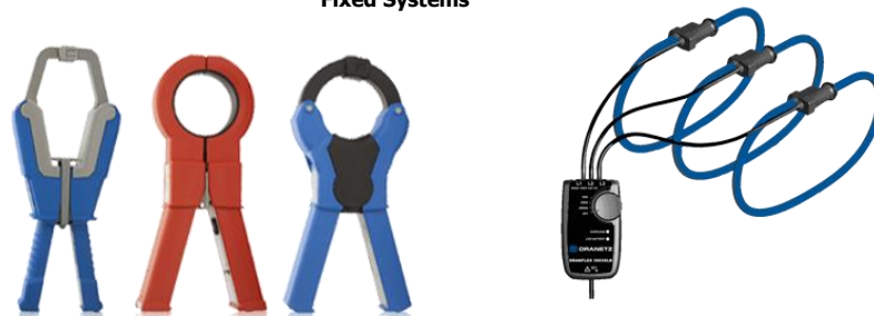
Dranetz Measurement Accessories