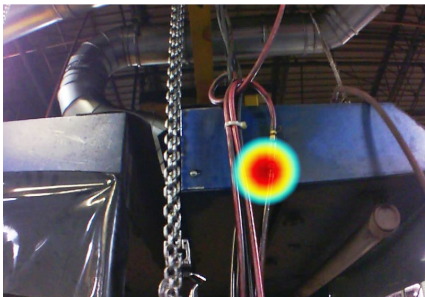
Images taken with the ii900 Sonic Industrial Imager in an industrial environment.

Fluke. Keeping your world up and running.®