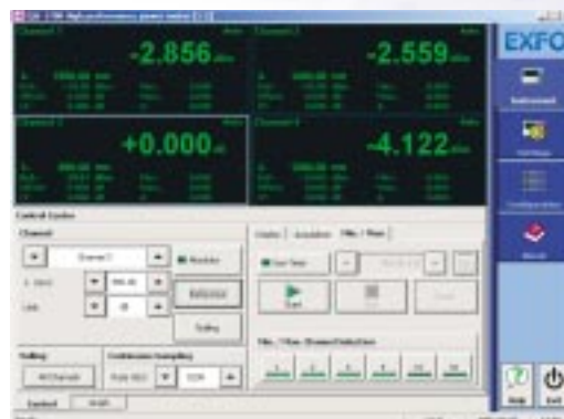
Take advantage of the intuitive graphical user interface for improved testing efficiency.

The IQS-1700's unique, patent-pending design will save time, cut costs and significantly enhance throughput with its continuous-mode peak-acquisition speed of 5208 acquisitions per second. The 80-dB range and 300- \mu s stabilization time will allow you to simultaneously measure high and low signals on up to four channels. Test more components in less time with the four-channel capability of the IQS-1700 High-Performance Power Meter.