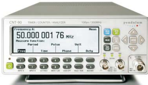
Figure 2: Measure function selection menu, shown with measured results.