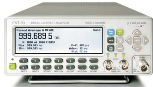
Figure 4: Display showing different statistical parameters viewed at the same time.