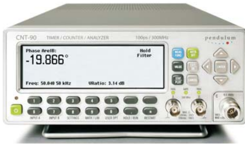
Figure 1: Display showing phase value, frequency, attenuation V_A/V_B , and auxiliary parameters.

When adjusting a frequency source to given limits, the graphic display gives fast and accurate visual calibration guidance.