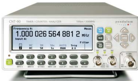
Figure 3: Input parameter setting menu shown with measured result.