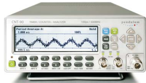
Figure 5: Display showing the trend (signal over time) of sampled data.