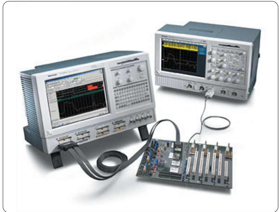
▶ TLA5000 Series with TDS5000 Series Oscilloscope.

Number of TDS Oscilloscopes That Can Be Connected to a TLA System – 1.