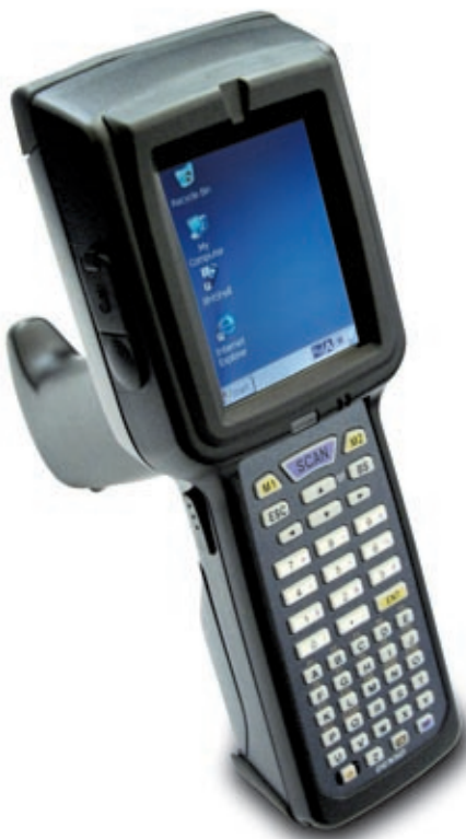
User-friendly thanks to ergonomic design and generously-sized keyboard.

The new barcode terminal series raises the bar in terms of mobility, capability and user-friendliness. More specifically, the BHT-400 is available as a batch- or radio-terminal for Wireless LAN (IEEE802.11 b/g). The devices may be connected to a PC, portable printer, modem or access point via Bluetooth® Version 1.2. The high speed processor (520 MHz) guarantees fast processing. Thanks to the latest operating system platform (Windows® CE 5.0), the application software can be customized to individual industry needs.